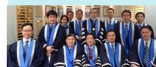
Council 2014 - 2016