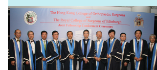
Council 2008 - 2010