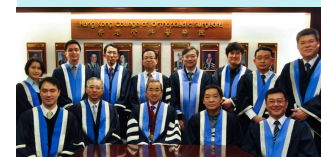
Council 2012 - 2014