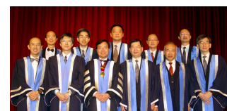
Council 2002 - 2004